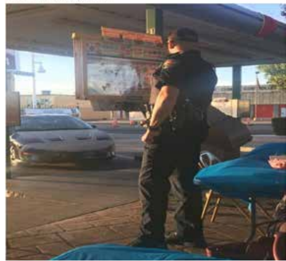
Follow us for more great stories and updates!!